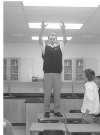
Do heavier objects fall faster than lighter objects?

Students were given the opportunity to explore the world of science through hands on activities: