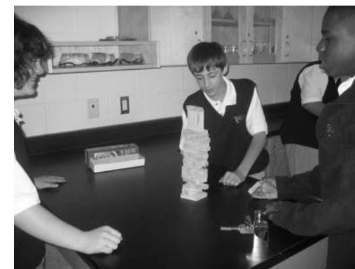
How does a game of Jenga relate to the study of an ecosystem?