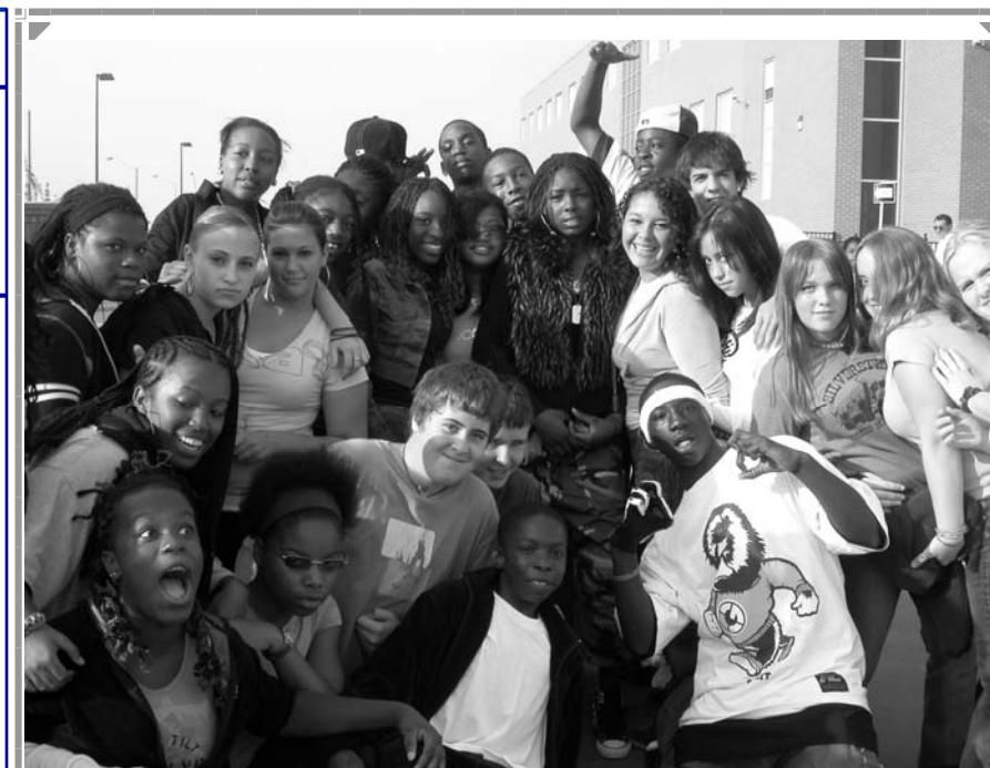
Faith, Hope and Charity are alive at Campion!

275 Brisdale Road Brampton, Ontario L7A 3C7 Telephone: 905-846-7124 Fax: 905-846-1527