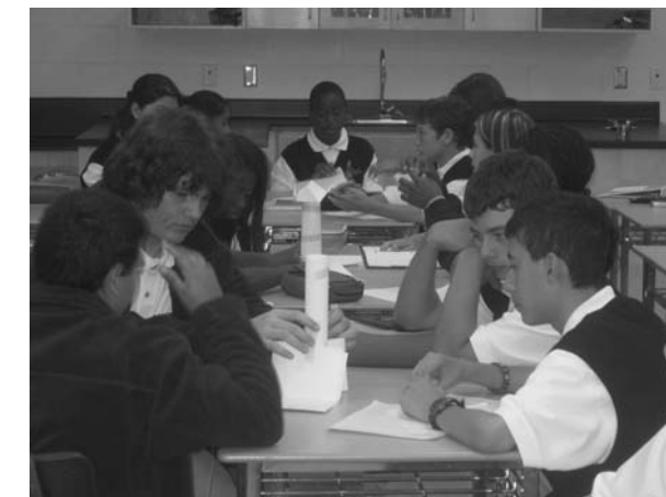
Can a tower constructed out of paper be designed to support a certain mass for a specific period of time?