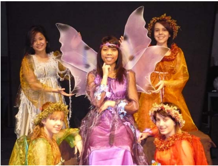
Titania and the fairies in the woods outside of Athens.