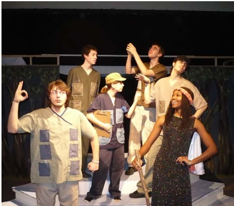
The Rude Mechanicals and Philostrate prepare for their performance for the Duke and the Nobels of Athens.