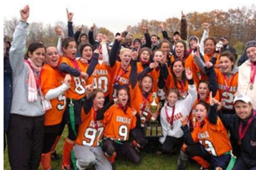
The Gonzaga Bulldogs won the Tier I Flag Football championship over the John Fraser Jaguars in a final game at the Mississauga Valleys football field yesterday.