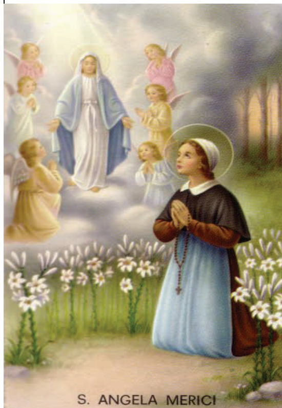
S. ANGELA MERICI