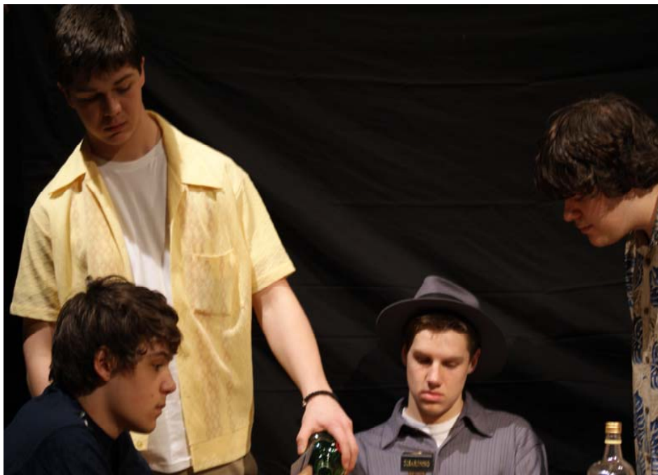
The boys continue to play poker late into the evening.