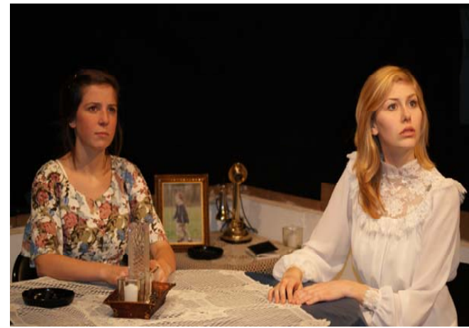
Blanche and Stella hear a loud noise coming from upstairs.

As a new Gonzaga Player, I must admit it has truly been a challenge for me. Streetcar has had numerous ups and downs, rehearsals full of frustration, and memorable moments but nothing compares to the success and rewarding end result. Everything was worth it. This experience has opened my eyes and I've developed respect for all the hard work that goes into it. Thank you to all the cast members, directors and everyone else who made it possible to put on such a wonderful production!!!