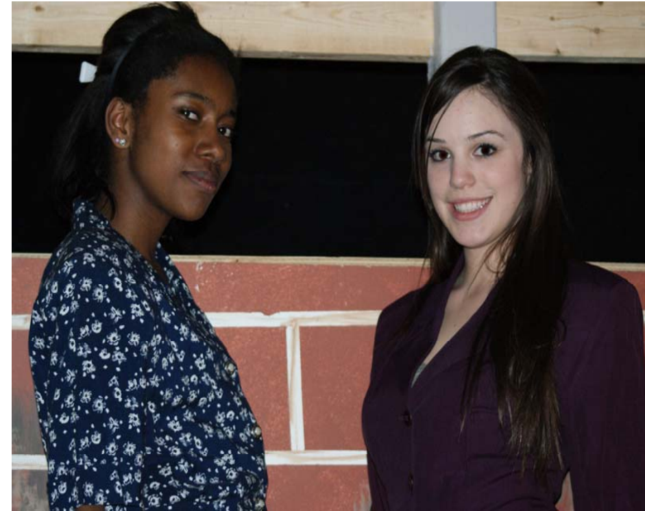
The Kowalski's neighbours look out into the quarter.