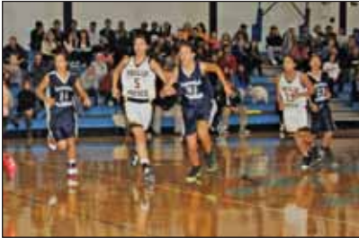
Hustling to a championship

Our Senior Lady Warriors Basketball Team had an outstanding season. On November 11th, we played Iona for the ROPSSA 'AAA' Championship. For the second straight year, our Lady Warriors won gold. We swept through our league playoffs and played Pockock in the Tier 2 Championship Game. Our Lady Warriors finished the