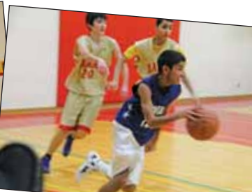
Leading the attack