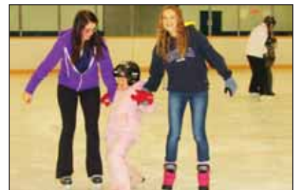
With a little help from new friends