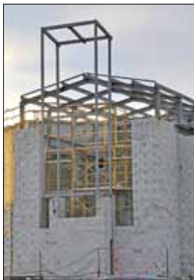
The chapel takes shape