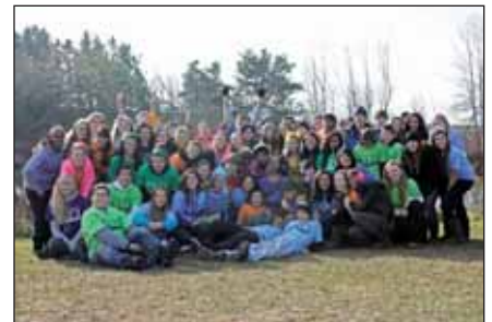
Loyola Leaders 2011