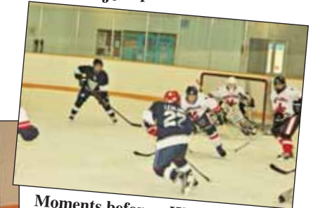
Moments before a Warrior Goal