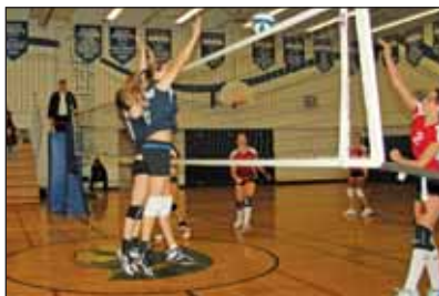
On the block