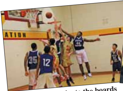
Warrior dominate the boards