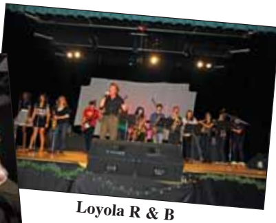
Loyola R & B