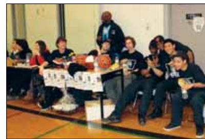
Hoopfest was sponsored by P.U.S.H.