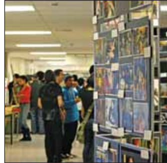
Loyola Art on display

and mosaics from the gr 10 art class. In addition the Grade 10, Grade 11 and Grade 12 photography classes displayed a variety of portrait, still life photographs and collages in both traditional and digital media. Mrs. Condotta and Mrs. Lorroway were very proud of their students! Work continues to be displayed in the library.