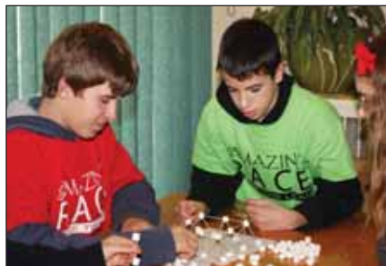
Marshmallow architects at work