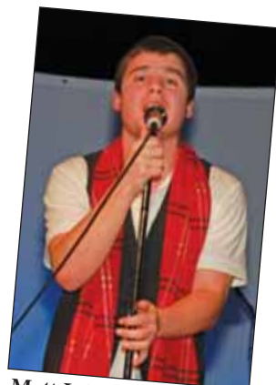
Matt LeBlanc belts out a song