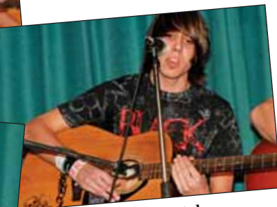
Singing with style