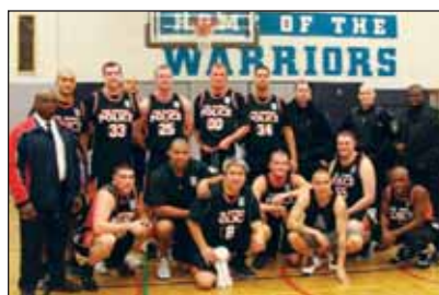
Peel Police Team

The P.U.S.H. (People United for Success and Hope) program was pleased to host the 3rd Annual Hoopfest competition, a basketball charity event. The Loyola Senior Boys Basketball team took on the Peel Regional Police basketball team in an intense and exciting match. Our Loyola Warriors were extremely impressive, winning 58-49. Proceeds from the event will go to the United Way of Peel. Look out for more P.U.S.H. charity events coming in semester two.