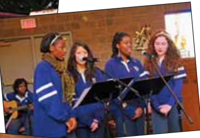
Loyola's Mass Band Singers