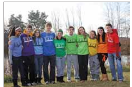
'Take the Lead' Leader Facilitators