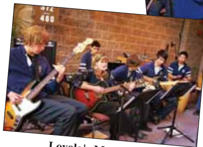
Loyola's Mass Band