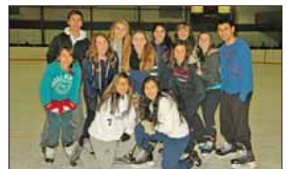
S.A.A. Skating Instructors with St. Clare