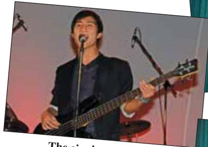
The singing guitarist