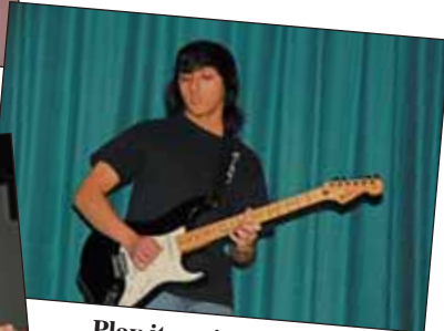
Play it again Cyrus