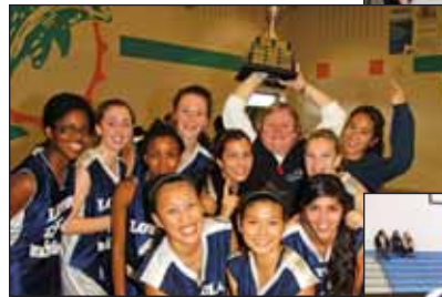
ROPSSAA 'AAA' Champions