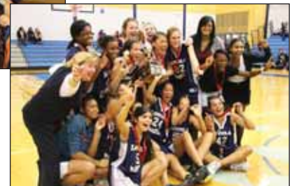
ROPSSAA Tier 2 Champions