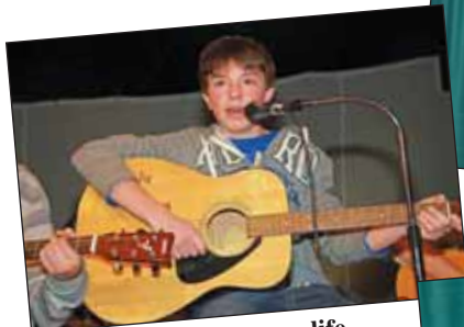
Time of your life