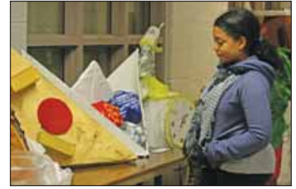
Taking in the art display

Loyola displayed the artwork of its many talented artists and photographers during the recent Feel the Beat art show in December. Artwork included huge pop art sculptures from the Gr 12 art class as well as wonderful paintings, drawings