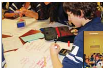
Finding the Solution