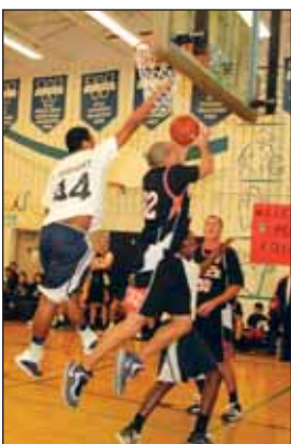
Action under the hoop

The P.U.S.H. (People United for Success and Hope) program was pleased to host the 3rd Annual Hoopfest competition, a basketball charity event. The Loyola Senior Boys Basketball team took on the Peel Regional Police basketball team in an intense and exciting match. Our Loyola Warriors were extremely impressive, winning 58-49. Proceeds from the event will go to the United Way of Peel. Look out for more P.U.S.H. charity events coming in semester two.