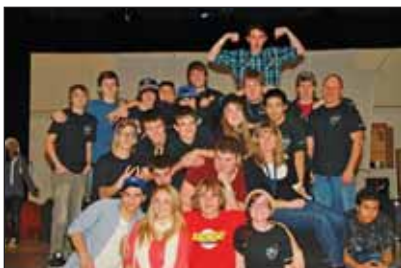
Sound and Light Rocks every time