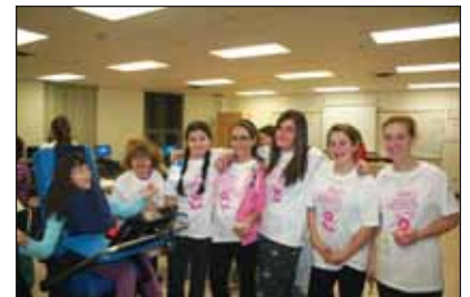
Making new friends at Girls Night In!

At the beginning of December, Loyola hosted its 3rd annual Girls Night In. It was a fun event for me and my Grade 9 female classmates to come together and enjoy a night filled with fun activities and games. First, we had some snacks and changed into comfy clothes and our special "Girls Night In" t-shirts. We also participated in a liturgy and two large group activities – a kickboxing lesson and an anti-bullying information session. After that, everyone enjoyed an amazing dinner of pasta, salad, garlic bread, and ice-cream sundaes. It was delicious! We then split up into small groups and did some activities such as a photo shoot, a Yell-OH! dance lesson, cupcake decorating, and an alternative health information session. At the end of the night, everyone got a gift-bag filled with lots of fun things, and names were drawn for some grand prizes.