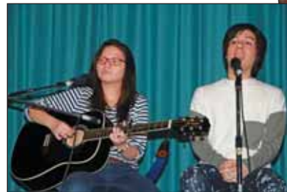
Amy Winehouse tribute