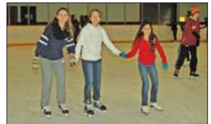
Bonding on the ice