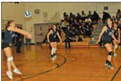
Setting up our attack