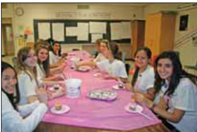
Cupcake decorating fun at Girls Night In!

At the beginning of December, Loyola hosted its 3rd annual Girls Night In. It was a fun event for me and my Grade 9 female classmates to come together and enjoy a night filled with fun activities and games. First, we had some snacks and changed into comfy clothes and our special "Girls Night In" t-shirts. We also participated in a liturgy and two large group activities – a kickboxing lesson and an anti-bullying information session. After that, everyone enjoyed an amazing dinner of pasta, salad, garlic bread, and ice-cream sundaes. It was delicious! We then split up into small groups and did some activities such as a photo shoot, a Yell-OH! dance lesson, cupcake decorating, and an alternative health information session. At the end of the night, everyone got a gift-bag filled with lots of fun things, and names were drawn for some grand prizes.