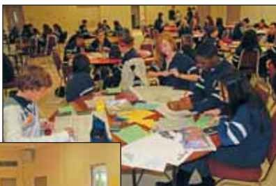
Math as a team effort