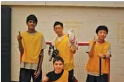
Boys Night In ball hockey tournament winners!

Instead of going home on Friday November 25th after the final school bell, roughly 50 grade 9 boys participated in Loyola's annual Grade 9 Boys Night In. This event gave the grade 9 boys an opportunity to take over Loyola right after school until the late hours of the evening. The boys socialized and interacted with their peers, while participating and competing in various activities.