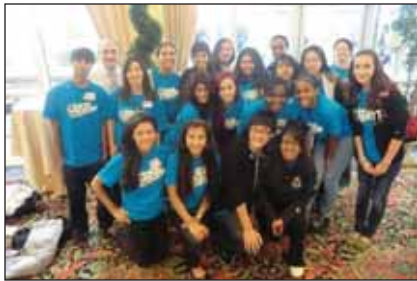
Friendly Link Leaders ready to help Grade 9 students!

Link Leaders are invited to continue to mentor and support their Grade 9 Crew throughout the rest of the school year.