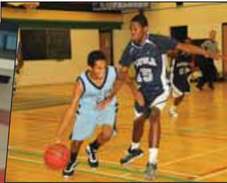
Jr. plays defense