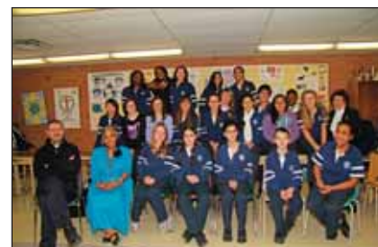
At Loyola, there’s always H.O.P.E.