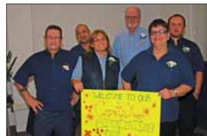
Loyola’s hardworking and caring custodial staff

The club continues to meet every Tuesday after school in room 141 to plan ways of helping other people everywhere. New members are always welcome.