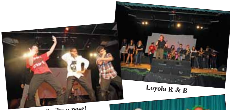
Strike a pose!