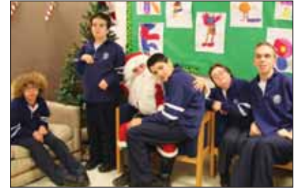
A great Christmas moment with Santa