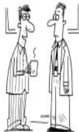
It's a natural progression from casual Fridays to Pajama Mondays.

You may notice that on Friday's staff will be dressed in a more casual fashion (jeans, etc.). This is not because they are starting their weekend early -- staff members are active participants in "Dress-Down Friday's" where a donation is made to United Way/ShareLife.