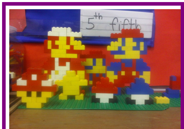
Super Mario Lego

PLEASE NOTE: Please send the above information to Peel Public Health, not to the school Thank you