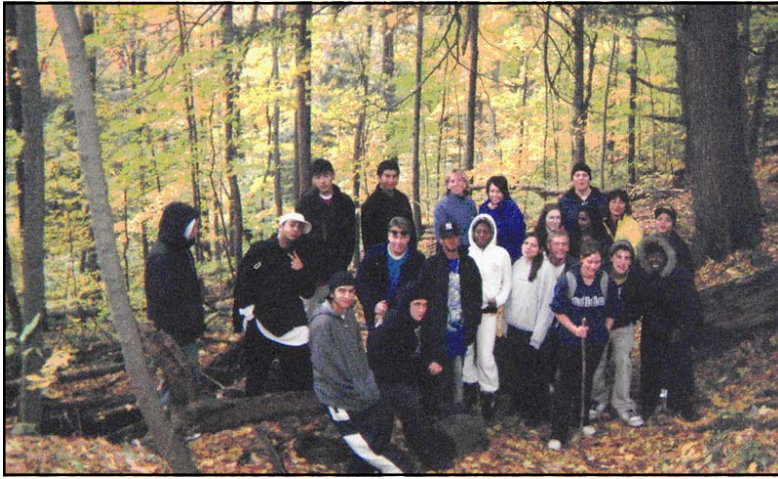
The Nature Walk, Silvercreek