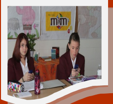
SMART Student Response system at work!