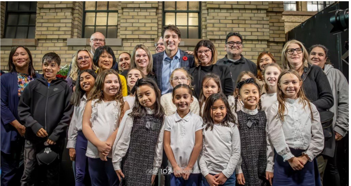
On November 1, the St. Vincent de Paul Catholic Elementary School choir performed O 'Canada for the opening ceremony of the Royal Winter Fair. Under the direction of Ernie Antoniow, the choir sang a bilingual rendition of our anthem and met Prime Minister Justin Trudeau and Toronto Mayor Olivia Chow.