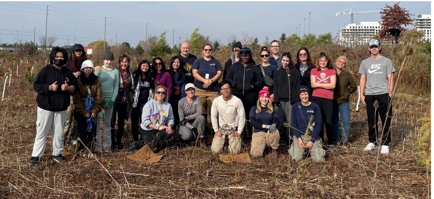
St. Oscar Romero Catholic Secondary School's Sanctuary North and South programs came together to plant native species of trees and shrubs at Andrew McCandless Park in Brampton with the Credit Valley Conservation Branch Out program.