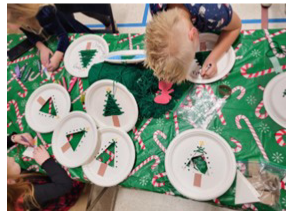
On November 24, former students of St. John Bosco Catholic Elementary School, along with Parent Council, volunteered their time to run a Christmas Community Event in the school gym. Families were able to pre-purchase a pizza dinner and have a photo taken with Santa. Children also had the chance to participate in crafts, games and activities, including writing a letter to Santa.