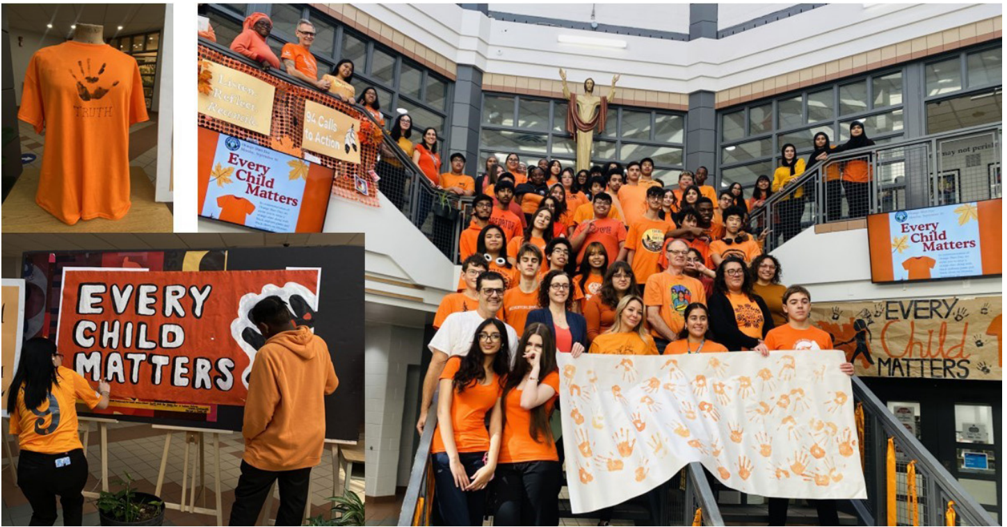
Students at Father Michael Goetz Catholic Secondary School commemorated the National Day for Truth and Reconciliation with a week-long event and a reading from the Truth and Reconciliation Commission’s Calls to Action. A striking display of orange ribbons and student-led artwork was showcased, and students engaged in hands-on activities exploring Indigenous culture in the foyer. They also learned about the significance of Orange Shirt Day and the importance of wearing orange to honour the survivors of residential schools and promote awareness of Indigenous experiences in Canada.