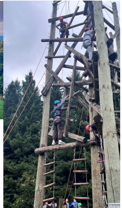
“We’re Arts & Culture SHSM and this is what we say, ee dance and sing, we draw and play, we act and say hooray!” This year’s cheer was a great way to send off 50 students new to Philip Pocock Catholic Secondary School’s Arts & Culture SHSM to YMCA Cedar Glen for the group’s first Certification Trip. This September, the overnight excursion provided many opportunities for students to focus on the virtues of faith and empathy among one another. While on this trip, students completed certifications in Customer Service, Leadership, and Personality Inventory. Aligned with DPCDSB’s Catholic Board Improvement Learning Cycle and the Ontario Catholic School Graduate Expectations, workshops focused on developing effective communication skills, building respect, encouraging the importance of being a life-long learner and collaborative contributor, and to thrive and excel in life’s challenges. Two great days to make new friends, bond with teachers, and appreciate nature - Pocock students definitely made life-long memories while on this trip.