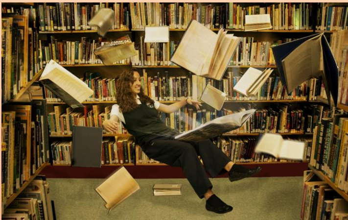
Take a Risk, Get Involved,... Levitate!

Speaking about things uplifting....check out this month's book display entitled, "Youth Making a Difference". Read about the power of love, courage, and hope in the face of disease, oppression, tyranny, and extreme hunger. In these unforgettable stories and memoirs, teenagers from Canada, the U.S., Cambodia, Vietnam, Iran, Afghanistan, Sierra Leone, Rwanda, and Uganda confront unimaginable challenges in the face of child labour, warfare, 21 st century slavery, AIDS and poverty.